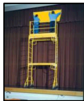
12' Narrow Tower