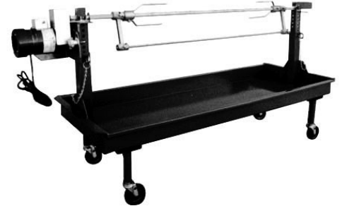
M35B Grill & Rotisserie